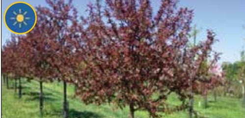
Sureau du Canada American Elder