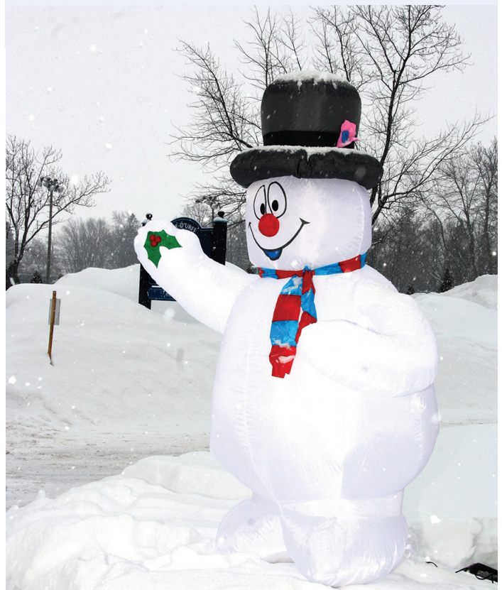
The views and opinions expressed in this article are those of the author and do not necessarily reflect those of the Municipal Council as a whole.

The many citizens who attended, enjoyed the horse drawn sleigh rides, the new outdoor curling event (thanks to the Baie-D'Urfé Curling Club ), the free refreshments, the maple taffy, the Junior Olympics events, the scavenger hunt. Thanks to Frans Lecluse for providing these pictures that captured the day's fun!